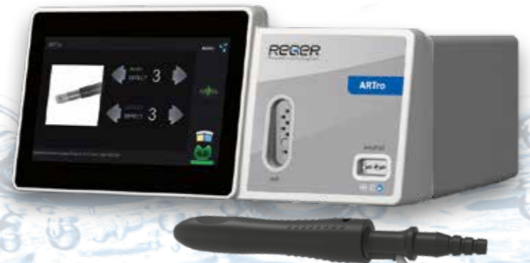
RF-Unit and delicate Handpiece