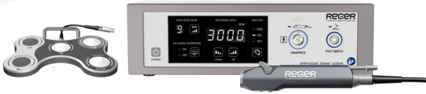
REGER Shaver System, Handpiece and Foot Switch